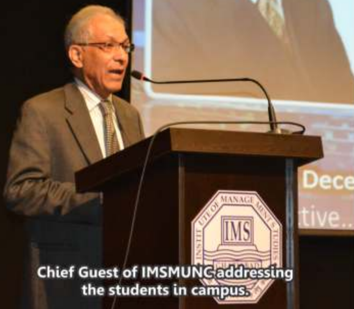
Chief Guest of IMSMUNC addressing the students in campus.